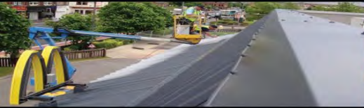
For Metal Roofs