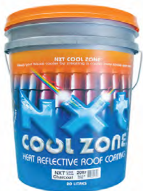
Available in 36 Colors