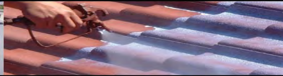
For Tile Roofs