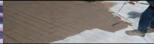
For Composite Roofs